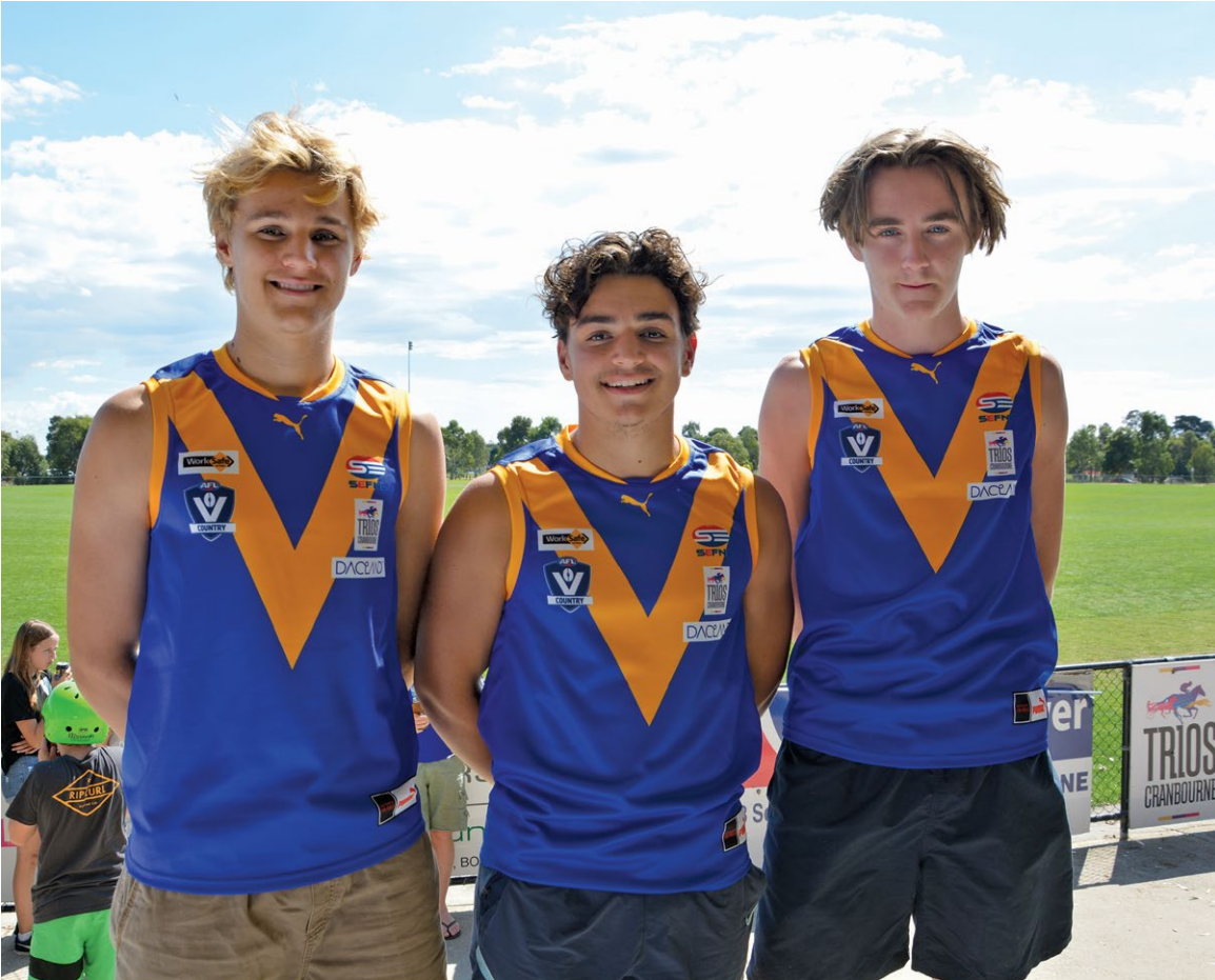
The day featured football games, appearances by AFL women’s team players, jumping castles and plenty of entertainment. Dacland hosted a raffle and handed out exclusive three game passes to purchasers in our Lochaven community.