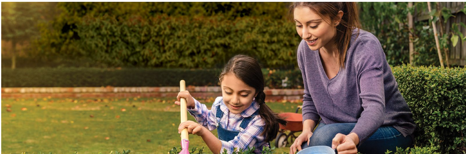
Dacland’s Great Garden Promise offers a $3000 landscaping rebate to purchasers who follow the design guidelines and maximise impact in their landscaping.

1. Geometry shapes the overall harmony When you start planning your new landscaping project, make sure that you keep the following in mind to create a cohesive front yard that