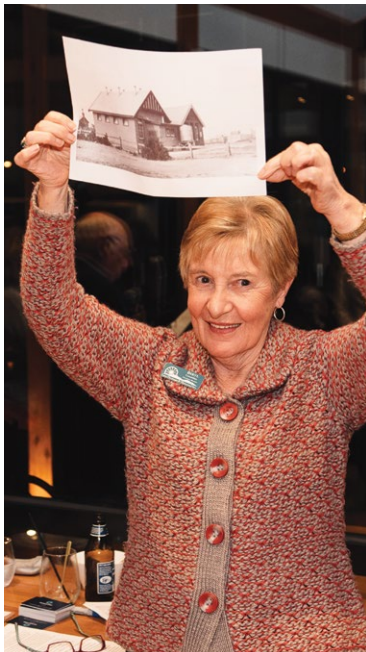
Purchasers forming new connections at the meet your neighbours event last April.