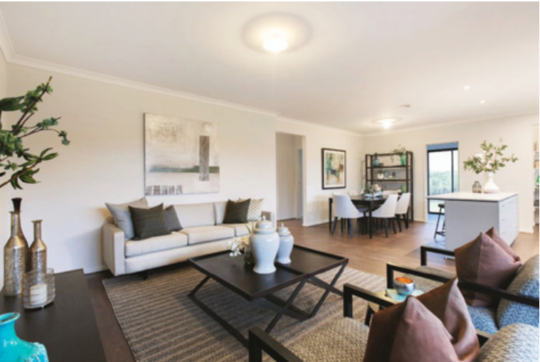
Pictured: Vienna H 19 by Porter Davis