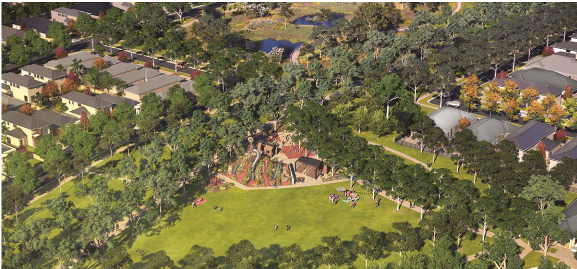
Manzeene Village will have magnificent botanic parklands that extend the entire length of the community.