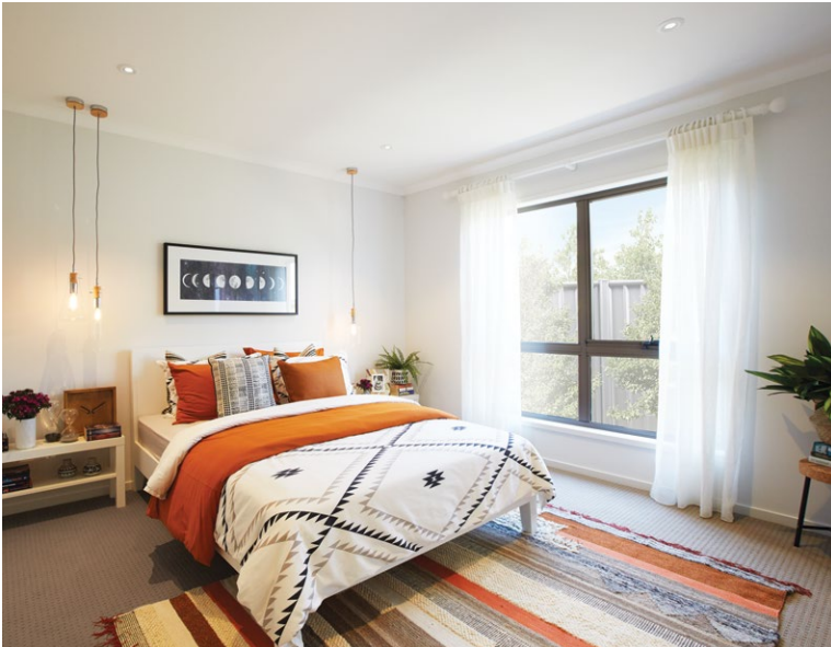
The Willow 25 Display Home makes an impact with natural light, generous space and pops of earthy hues creating a sanctuary-like feel.

You can find these affordable looks and many more on the Homebuyers centre Instagram @homebuyerscentrevic and Facebook page facebook.com/homebuyerscentrevictoria.