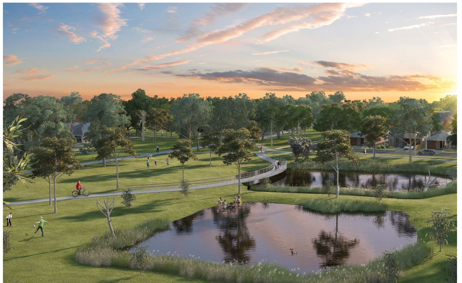
The government's proposal to double the first home buyers grant in Regional Victoria, may benefit purchasers at Manzeene Village in Lara.

all properties below $600,000 for first home buyers may make a property purchase more achievable. The capping at $600,000 may also provide incentive for first home buyers to consider buying house and land, with many greenfield areas able to offer a brand new four bedroom home for under $600,000.